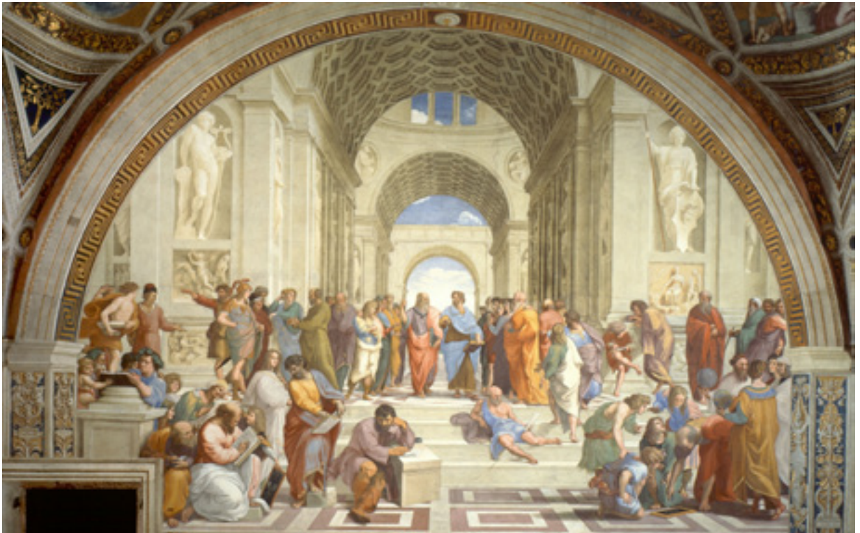
The School of Athens by Raphael. A legend for this painting, identifying the various figures, has never been found. We suggest the possibilities on the following page.

T he School of Athens was painted by the Italian Renaissance painter, Raffaello Sanzio da Urbino (1483–1520), better known simply as Raphael, when he was twenty-seven years old. Commissioned for Pope Julius II (1503–1513), this large fresco (5.77 x 8.14 meters, 16.5 x 25 feet) can still be viewed in the Room of the Segnatura (the highest court of the Holy See) within the Vatican. The frescoes in this room mark the beginning of the high Renaissance. 1 Raphael is often associated with Renaissance Neoplatonism because of his skillful depictions of the ideal. Raphael died on his thirty-seventh birthday in 1520.