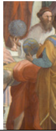
Zoroaster (holding the heavenly sphere)