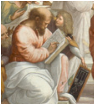
Pythagoras (with Sacred Tetraktys)