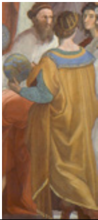
Ptolemy (holding the earthly sphere)