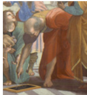
Euclid (teaching geometry to his pupils)