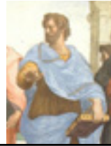
Aristotle (holding Ethics )