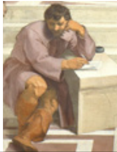
Heraclitus (a portrait of the artist Michelangelo)