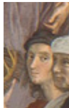
Raphael (Self Portrait)